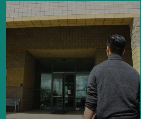
First Episode Center Member