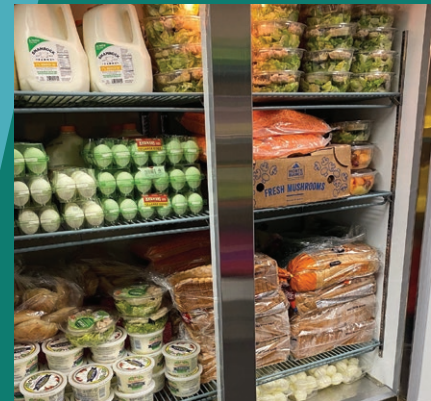
Valleywise Health Food Pharmacy