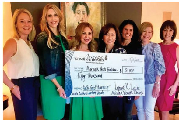
Valleywise Health Foundation's 2019 Legacy Award recipients, the Arizona Women's Board, increased their annual support making the new Valleywise Health Food Pharmacy program possible in 2019.