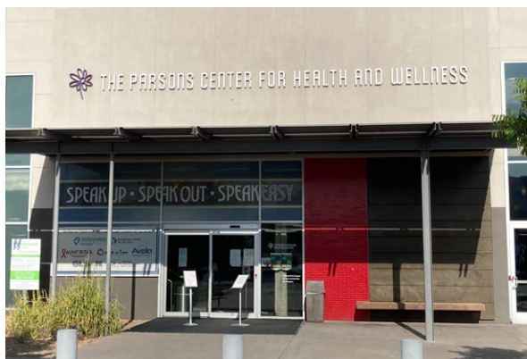
A $5,000 grant from the MAC Cosmetics AIDS Fund makes the Women's Breakfast Club at the Valleywise Community Health Center - McDowell possible.

"I get a chance to be around women who are just like me and going through the same challenges I am."