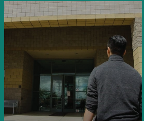
First Episode Center Member