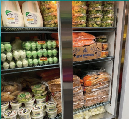
Valleywise Health Food Pharmacy