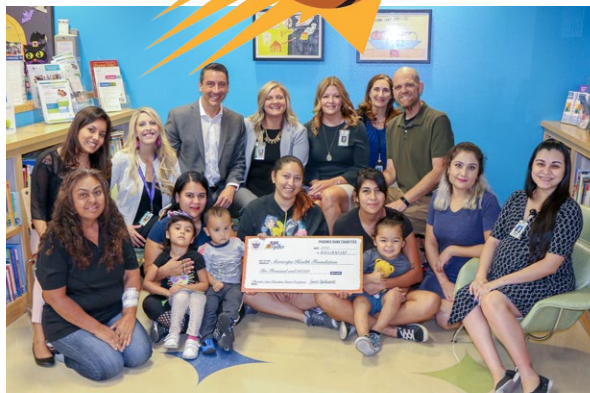
Valleywise Health Foundation's first Phoenix Suns Charities grant was awarded in 2019. The $10,000 gift supported Arizona children and families through the four Valleywise Health Family Learning Centers.