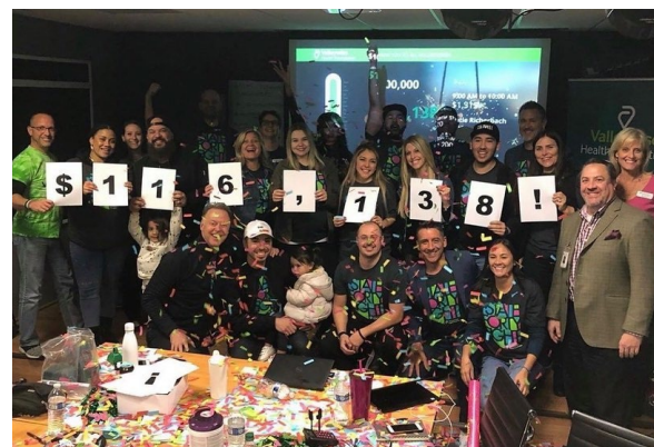
In partnership with Entercom Phoenix, the first LIVE 101.5 GIVE-A-THON benefiting Valleywise Health took place in December 2019.

"I get a chance to be around women who are just like me and going through the same challenges I am."